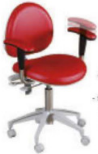
Adjustable arms - see optional extras on page 21

► The HGEM-SAB is a specialist stool. Whilst the back rest will act as a lumbar support, it has been designed for an operative that requires a moveable arm, without having to leave the stool.