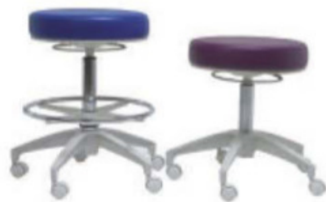
High cylinder lowest point