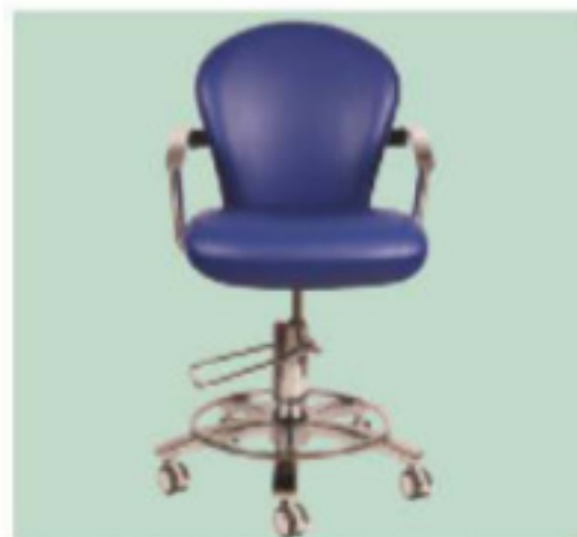
CHROMA-HYD PATIENT CHAIR