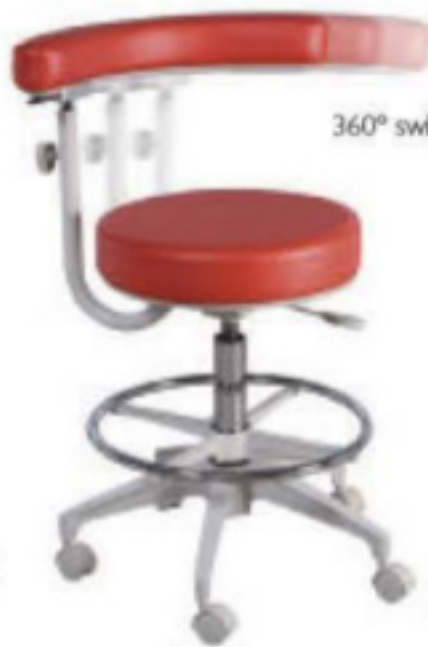
360° swing around backrest

This is very popular with Dental Nurses, Head & Neck Surgeons and Vascular Sonographers.