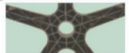
Typical honeycomb base

Many other bases are strengthened by a honeycomb effect on the underside creating an ideal place for bacteria to breed.