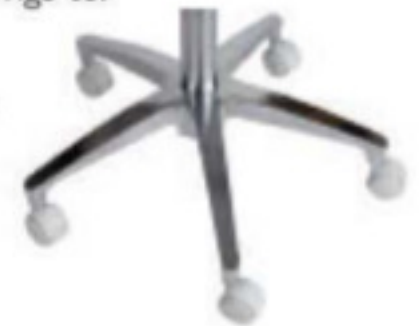
Polished aluminium base

of the chair is powder coated aluminium, which can be upgraded to polished aluminium.