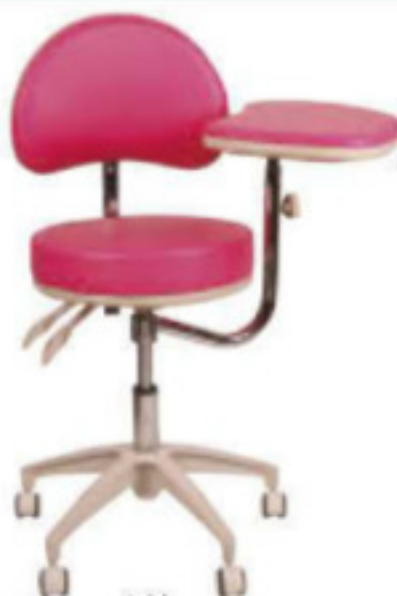
table attachment - see optional extras on page 21

Two-tone colour option available at no extra cost on all chairs.