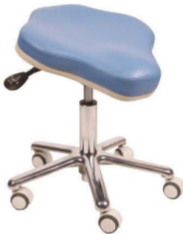
POS-NB-S-TILT with 19" aluminium base - see optional extras on page 21