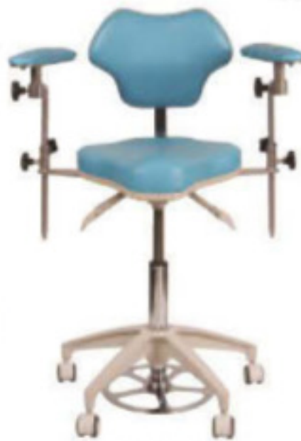
POS-DC with Dixon arms & FHC - see optional extras on page 21