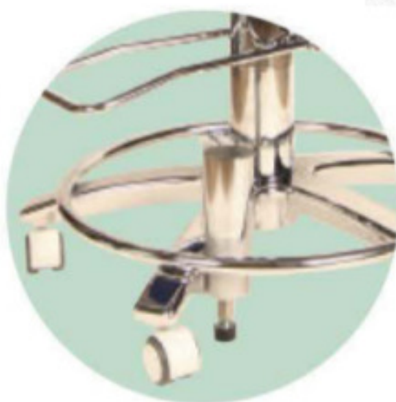
Brake stop - see optional extras on page 20