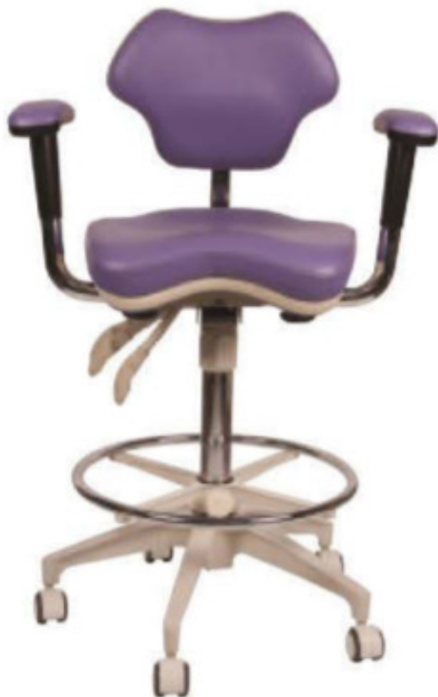
HFS-DC- Adjarm - see optional extras on page 21

Discounts available on volume orders. Delivery charge £10.00 per item. UK mainland excluding Scottish Highlands and offshore islands (out of area price on application). Prices are exclusive of VAT. Murray stools are covered by our 5 Year Guarantee, excluding upholstery.