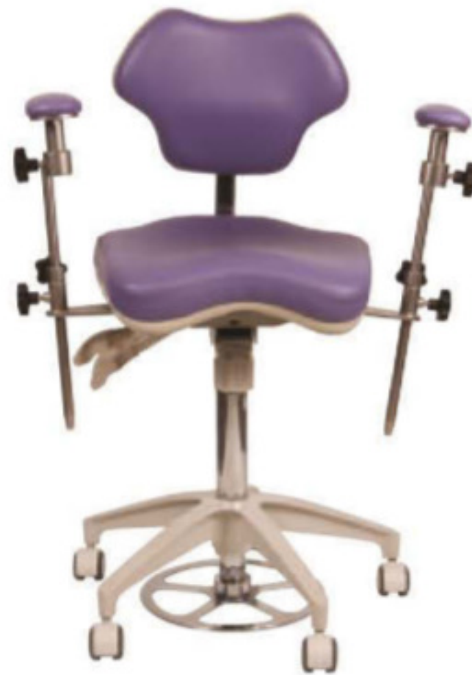
HFS-DC-Dix-arm-FHC - see optional extras on page 21