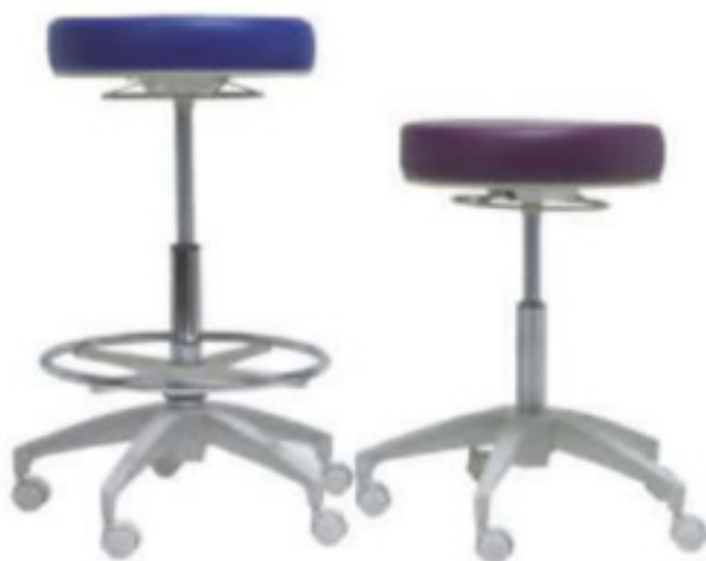
High cylinder highest point

Our seating is normally supplied with the option of a standard or high cylinder; however, if required, we are able to supply a lower or higher option. Should this be required, please contact us for details. An adjustable foot ring/rest is supplied as standard when ordered with a high cylinder - whilst not recommended this may be removed if required.