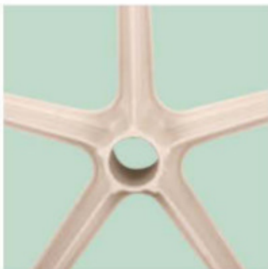
Murray's wipe clean base