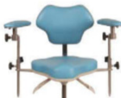
Dixon arms - see optional extras on page 21

This is proving extremely popular for Ophthalmic and Micro Surgery along with other specialised therapy areas where precise height control is paramount.