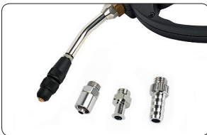
Fig. left: MELAJet® with individual attachments