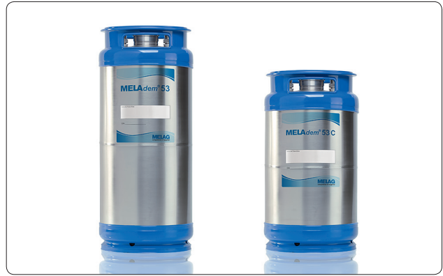
MELAdem® 53 and MELAdem® 53 C