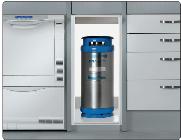
MELAdem® 53 fitted in a floor unit