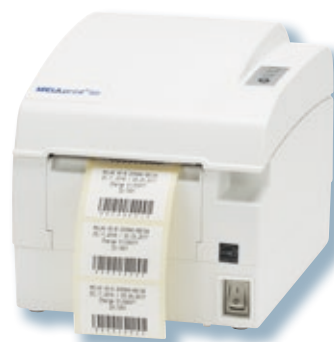
Barcode label printing with MELAprint 60

The Evolution steam sterilizers offer many possibilities for documentation – starting with the network integration via the Ethernet interface, to the printout of barcode labels for the labelling of wrapped instruments, through to the output of the protocols to the CF card.