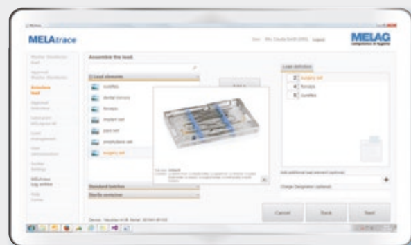
The documentation software MELAtrace

The documentation software MELAtrace provides the perfect solution for practices and clinics that would like to securely document and approve their complete hygiene workflow. MELAtrace makes it possible to connect all steps of the instrument decontamination, from cleaning and disinfection, to wrapping through to sterilization. All process steps, program protocols and the decisions related to instrument decontamination are fully documented and archived securely. Barcode labels can be printed using the MELAprint 60 printer in order to trace the load instruments, to easily read them using a scanner and to pass them on to the practice management software.