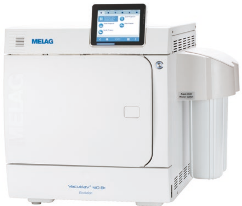
Vacuklav 40 B+ Evolution with side-mounted MELAdem 40

Save the time and money that you would require when purchasing, transporting, storing and filling distilled or demineralised water in your steam sterilizers and instead, connect your Evolution steam sterilizer to a water treatment unit. If there is a water supply and water drain near the steam sterilizer, you not only automate the filling and dosing, but also the drainage of the used water. From the small practical MELAdem40 to the highly economical and environmentally friendly reverse osmosis system MELAdem 47, through to the high-performance system MELAdem53 (for simultaneous connection of a washer disinfectant), we offer the right solution for every desired application.