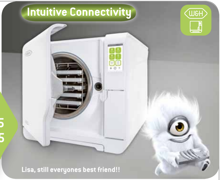
Lisa, still everyone's best friend!!

Special Price Lisa 17 £4,785 Lisa 22 £5,335 + FREE iPad